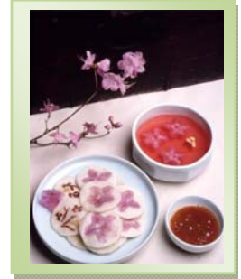
This is an image.

We invite distinguished speakers for lunch from various cultures once a month, and share the discussion with friends; members and non-members.